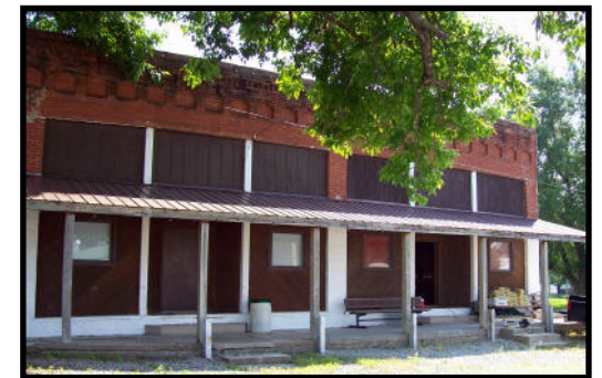
Former stores along Mendon's Main Street have been adaptively reused as apartments and lodging for hunters and city dwellers who enjoy weekends in the country.