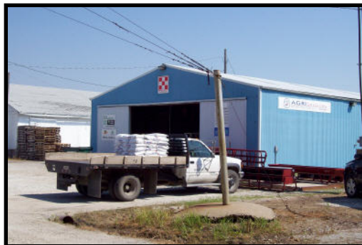
Farming plays a vital role in Mendon's economy.