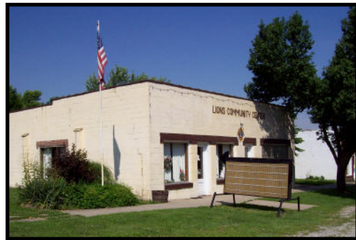
The Mendon Lions Club building is also used for community gatherings, receptions, and reunions. It is conveniently located next to the Lions Club park.