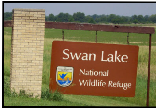
Mendon is in close proximity to Swan Lake National Wildlife Refuge.