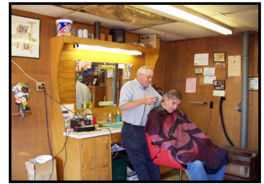
Brown's Barber Shop can be found in downtown Mendon.