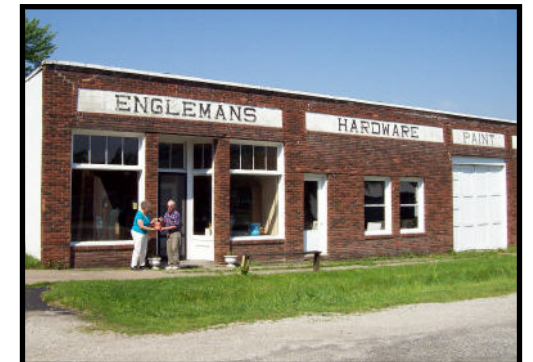
Another long-time business in Mendon is Engleman's Lumber Co.