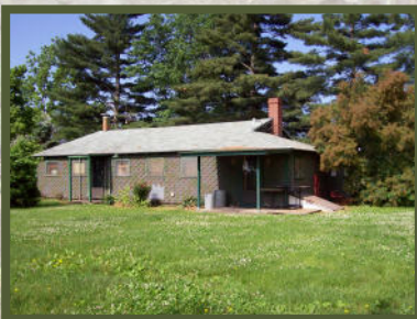
Fond Memories of the Cut-off Lake