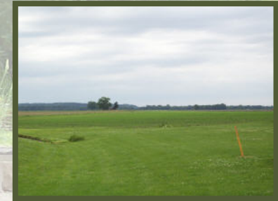
Beautiful Bowling Green Township Prairie