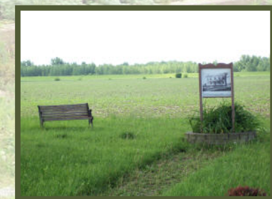
Many Family Farms are Centennial Farms