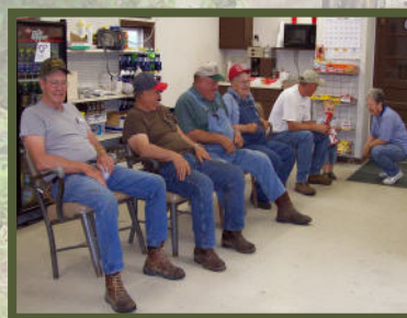
Farmer's Visit at Dalton Elevator