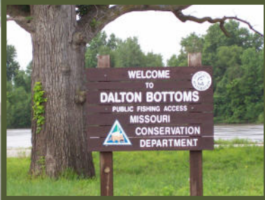
Picnicking and Fun on the Water