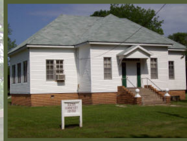
Dalton Community Center (formerly Dalton Village School)