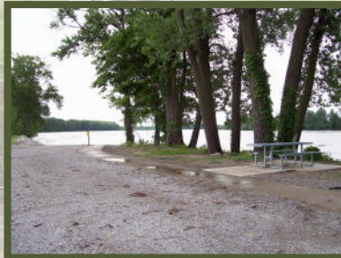
Scenic View of the Missouri River